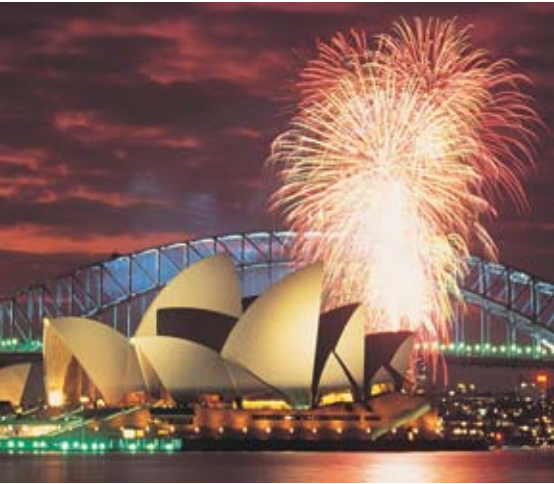
Sydney Opera House