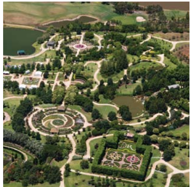
Hunter Valley · Royal Gardens