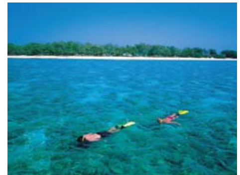
Opportunity to snorkel on the Reef

Day 13 Cairns. Enjoy a leisurely morning in this tropical city. Transfer to Cairns Airport. (B)