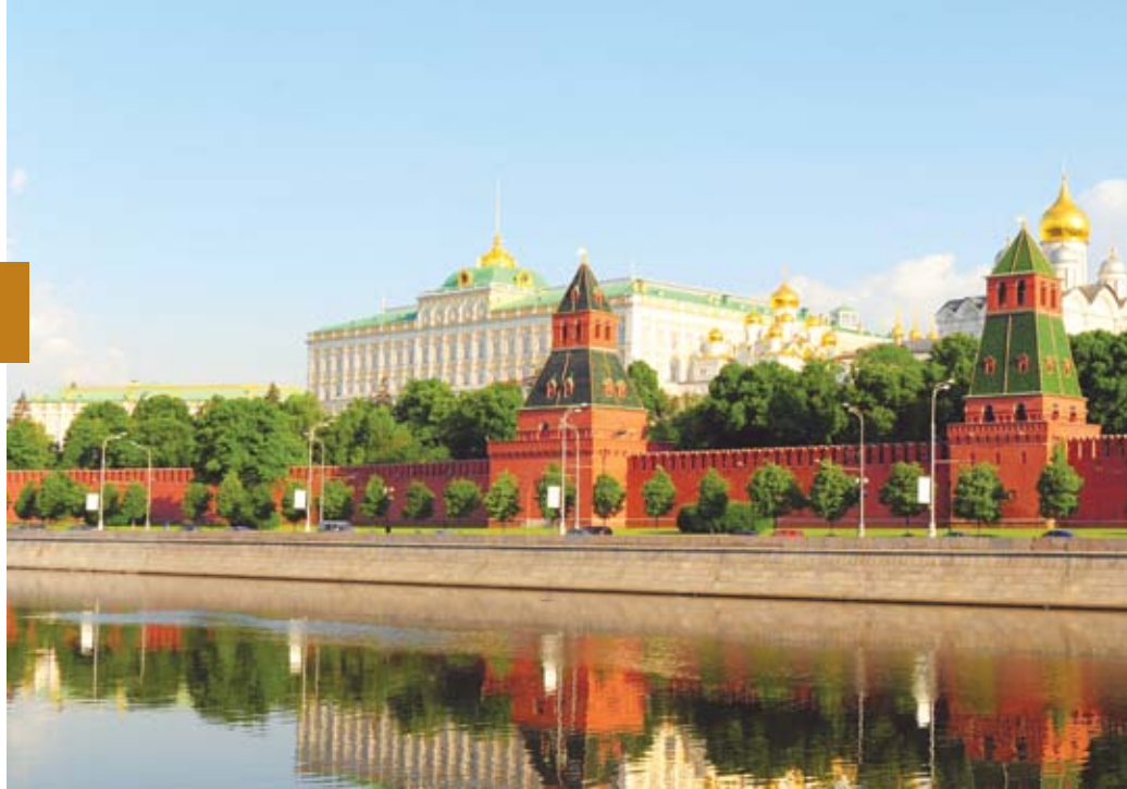
Day 3 · Guided visit of the Kremlin, Moscow

A cruise is the best way to travel in Russia as it gives you more possibilities to discover places usually hidden to a regular tourist. Explore the mystery of this large country, feel the special beauty of its quiet provincial towns and the impetuous life of its imperial capitals – Moscow and St. Petersburg! While cruising down the river in Russia, you will enjoy unique Russian cuisine, folk music, decorative arts and immerse yourself deeper into Russian history.