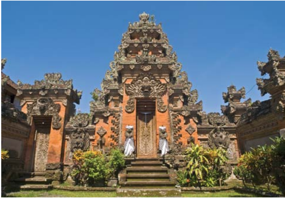
Bali Temple in Ubud

The island of Bali is a masterpiece of nature with its fertile volcanic soil and its terraced rice fields. The physical beauty of the island and the year-round pleasant climate make it a place regarded by many visitors as the "Ultimate Island". The mangrove lining Benoa Harbour gives way to superb beaches along the north-eastern shore of the peninsula. Nusa Dua and Tanjung Benoa have been developed into a major tourist project over the last decade.