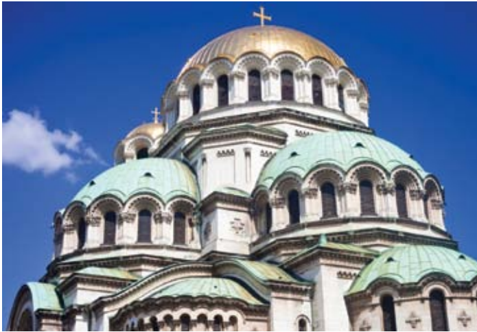
Alexander Nevski Cathedral