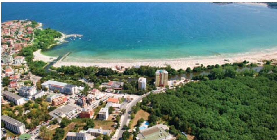
Black Sea Coast