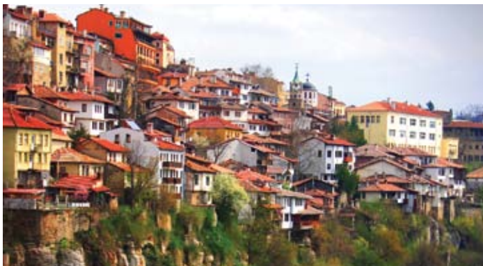
Typical Balkan houses on a hill in Veliko Tarnovo, Bulgaria