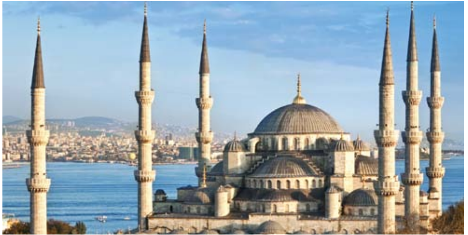
Blue Mosque Istanbul

Home to more than 20 different intriguing civilizations dating back 10,000 years, Turkey and its rich heritage can be experienced by visits to the many temples, churches, mosques, tombs, statues and palaces throughout the country. Combined with fascinating natural sceneries, hot springs, waterfalls and mountain chains, there is much to see and experience in Turkey.