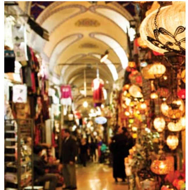
Grand Bazaar, Istanbul

Day 11 Istanbul • Canada • Today is your last day in exotic Turkey. Transfer to the airport for your return flight back to Canada. (B)