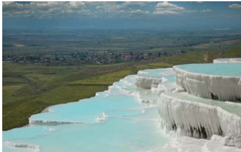
Pamukkale Hot spring Waterfalls